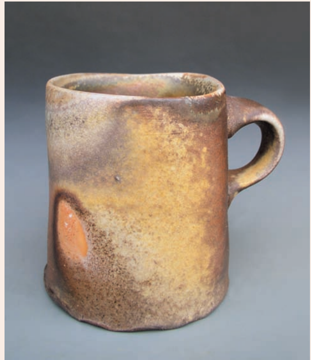
"Lush Mug," 3½ in. (9 cm) in height, thrown and altered porcelain, fired in an anagama, 2005, by Simon Levin, Gresham, Wisconsin.

The mug to the right offers a much better relationship between handle and lip treatments. The wad mark on the side is a nice echo of the negative space of the handle. The soft flashing is like the wandering lines of lip and foot, yet the bottom half of the handle feels thin and rigid. Imagine if it were more plump.