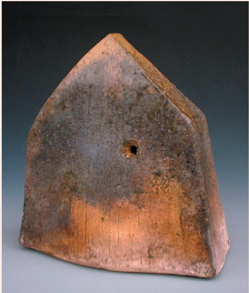
“Dream House Volume 3,” 12 in. (30 cm) in height, wire cut and hollowed stoneware, fired in an anagama with sand, 2004.

The second generation of houses became much smaller (under 4 in.), and though the edges remained sharp, the planes and the lines of the houses became wandering and gestural. I was still locked in my assumptions of the houses as individual works until my 3-year-old daughter started to arrange them into a city. Her honest interaction with the pieces threw the work in a modular direction where I create relationships between houses. I can create neighborhoods such as the one on page 34. Changing shapes and surfaces across many houses creates rhythms and even narratives. I often ponder which house is the Boo Radley house of the neighborhood. Grouping the houses allows me to consider the implications and how the results might feed my next series.