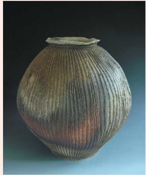
"Combed Jar," 14 in. (36 cm) in height, thrown and plumped stoneware, with dry slip, fired in an anagama, 2006, $350.

I have been making these large thrown jars for several years now and they have evolved nicely. I am drawn to how the swelling surface is accented by lines that broaden and flatten toward the widest point and narrow at the neck and foot. I use a dry slip technique to soften the effects of shiny ash and I love the misty movements of flame path across the side of this jar. The suggestion of symmetry in the form gives the vessel breath and life, and makes me want to take the journey around it. The weak point for me is the lip. The edge of the lip is a nice echo of the wandering edge on the foot, but the point at which the texture ends is muddy and unclear. I need to find a clear way to think about the rims of these jars, but because they are an anachronistic form I struggle to justify direction.