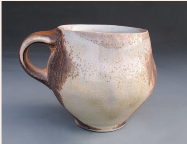
"Swiss Mug," 3½ in. (9 cm) in height, thrown porcelain, fired in an anagama, 2005.

I am disappointed with the edge of the lip of the cup above. The handle is full, the belly swells nicely but the lip is so sharp. The handle also fails to continue the line created by the belly.